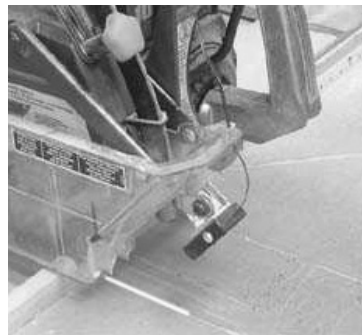
Figure 2. Mounted on kickback