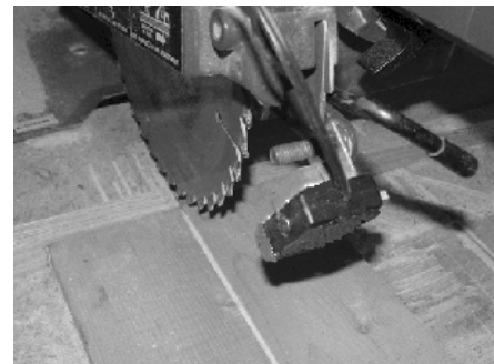
Figure 3. Mounted to right side kickback

For installation information on specific saws, visit www.laserkerf.com or call (859) 494-0790.